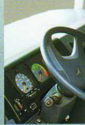
Excellent overall visibility designed driver's compartment ensures safety and comfort during operation.