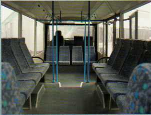
A spacious and extravagant interior offers a pleasant and enjoyable atmosphere.