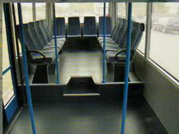
Technical revolution for this size of bus: vast low floor standing area with most comfortable access through the 1-step exit.

Compact from the outside but spacious inside, the COBUS 2400 is the ideal bus for VIP- First and Business Class passengers as well as for crew or "last minute passenger" transportation. Along traditional COBUS lines, the COBUS 2400 is mounted on a Mercedes Benz chassis and manufactured in series production – synonyms for a world-wide service network and state-of-the-art technology. The engine-gearbox-drive combination provides sufficient power at the lowest fuel consumption alike. Conformity to Euro II exhaust emission regulations is standard.